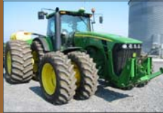
John Deere 8530 275HP, 4 SVC ILS F. Axle