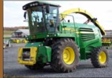
John Deere 7700 SPFH, KP 513HP, 4WD