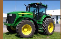
John Deere 7630 140HP, PowerQuad Excellent Cond.

Look for your John Deere Harvest catalog in the mail. It's full of parts, oil, supplies and more with sale pricing.