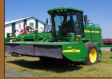
John Deere 4995 SP Windrower w/ 14'6" Platform Steel Roll Conditioner